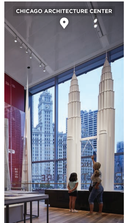
CHICAGO ARCHITECTURE CENTER