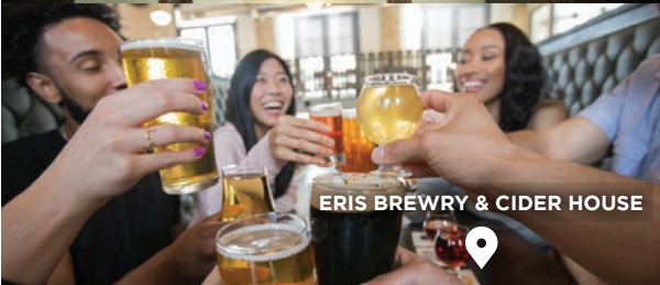
ERIS BREWRY & CIDER HOUSE