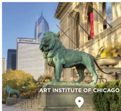
ART INSTITUTE OF CHICAGO