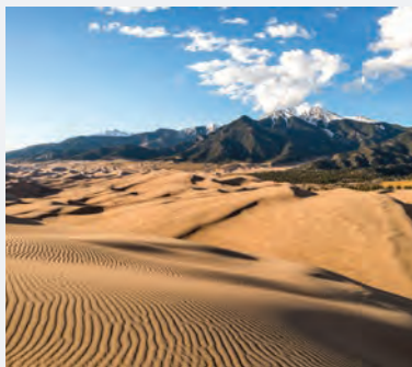
GREAT SAND DUNES NATIONAL PARK AND PRESERVE 4 HOURS from Denver