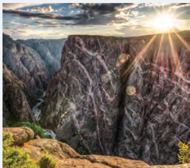
BLACK CANYON OF THE GUNNISON NATIONAL PARK 4 HOURS, 45 MINUTES from Denver