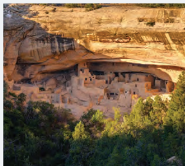
MESA VERDE NATIONAL PARK 6 HOURS, 30 MINUTES from Denver