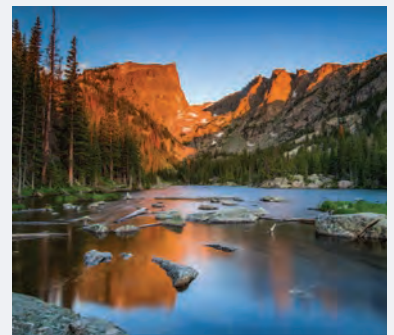
ROCKY MOUNTAIN NATIONAL PARK 1 HOUR, 40 MINUTES from Denver