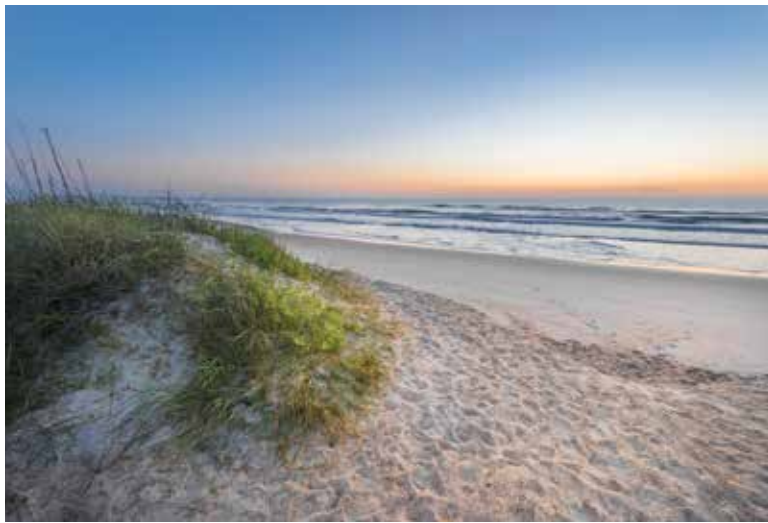
St. Augustine and the surrounding area is home to some of the best beaches in Florida - more than 42 miles of them.