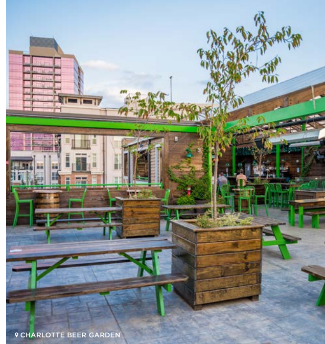
9 CHARLOTTE BEER GARDEN