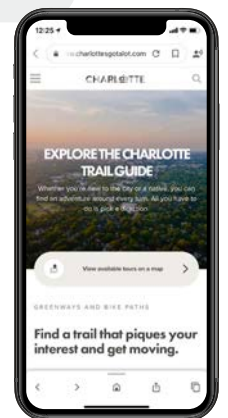
CLT TRAIL GUIDE