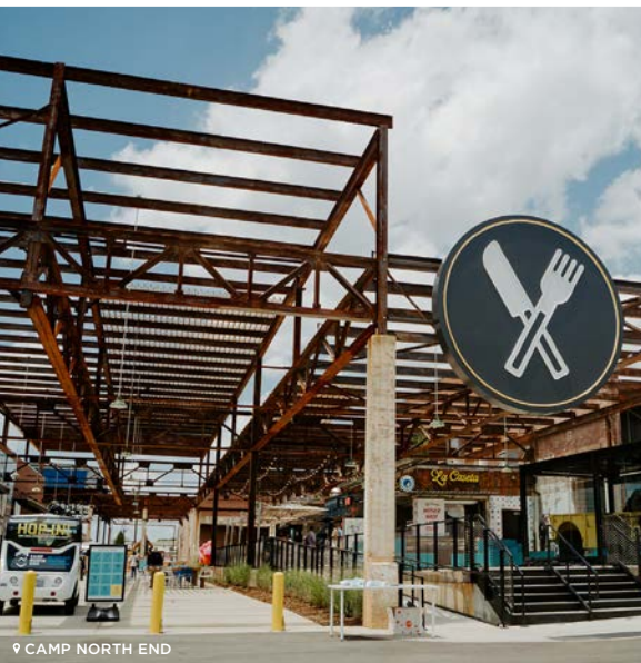
9 CAMP NORTH END