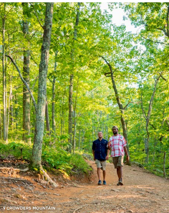
9 CROWDERS MOUNTAIN