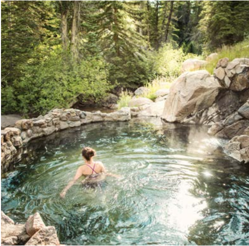
STRAWBERRY HOT SPRINGS