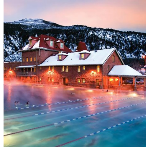
GLENWOOD HOT SPRINGS POOL