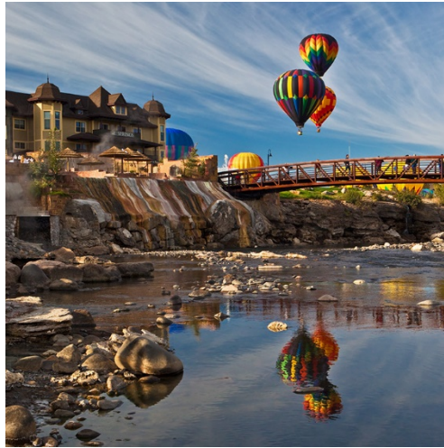
PAGOSA SPRINGS HOT SPRINGS